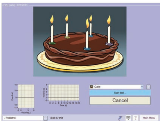
Spirometry incentive screen